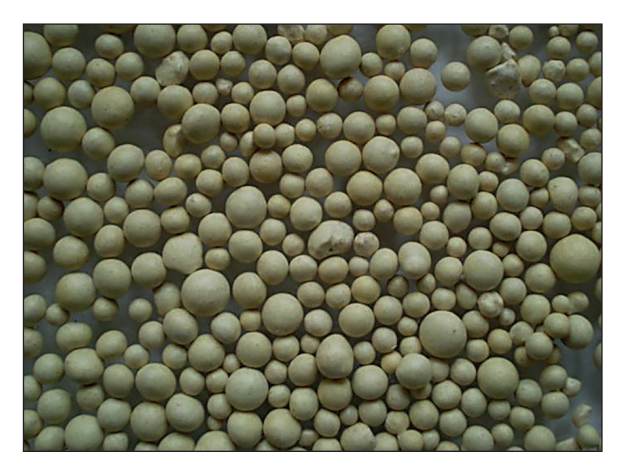
Figure 2. Appearance of the encapsulated granular ANP fertilizer with a polystyrene-lignin shell